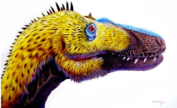
Nanotyrannus