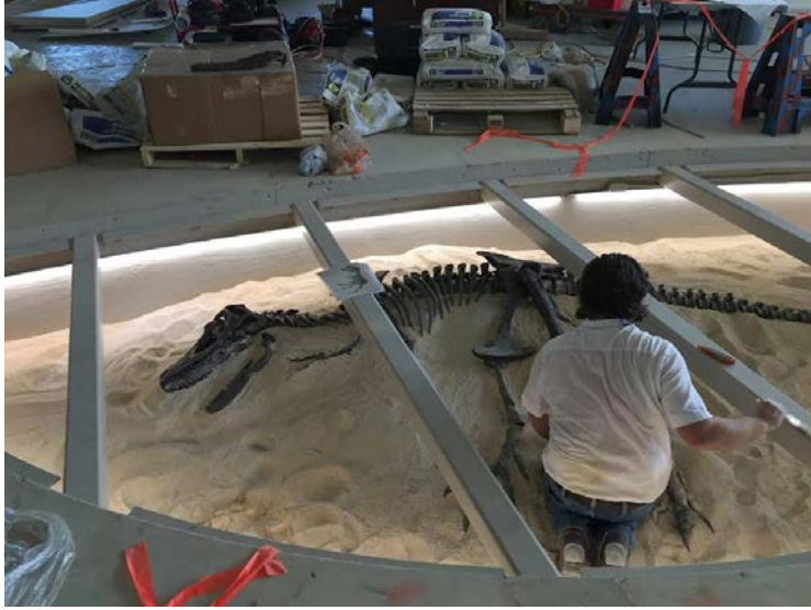
Laurel Branch Library Nanotyrannus skeleton being placed in the flooring.